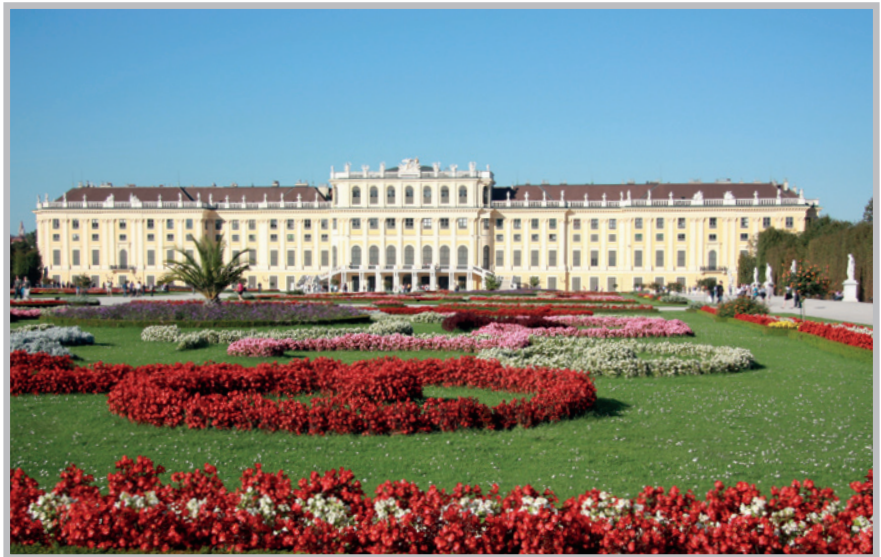
Schloss Schönbrunn, Vienna

Update in Dyslipidemias and Newbornscreening